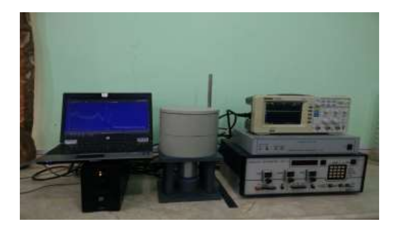
Fig. (2): Gamma spectroscopy system used in the present study.