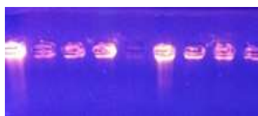
Figure 1: Total genomic

Total genomic DNA extracted from blood using 1% agarose gel electrophoresis.